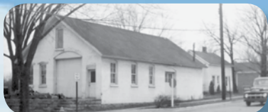
The Dart story begins with a small machine shop in Mason, Michigan known as Dart Manufacturing Company.

The Dart story begins with a small machine shop in Mason, Michigan known as Dart Manufacturing Company. Established in 1937, this modest business prospered through the manufacture of such products as plastic key cases, steel tape measures, and identification tags for the armed services.